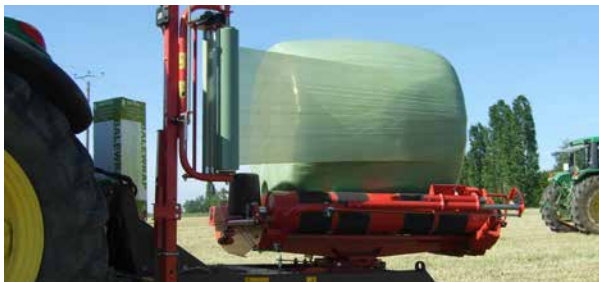
Bale and wrap counter is standard.

Farmer wrapper ideal for 'wrap & stack' operation