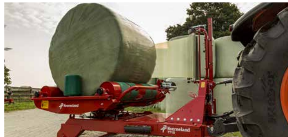
Able to handle round balers up to 1200 kg.